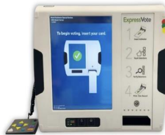
Ballot Marking Device (BMD) (formerly the ExpressVote Machine)