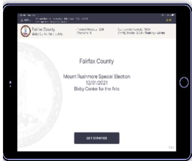
E-Pollbook (formerly the Poll Pad)