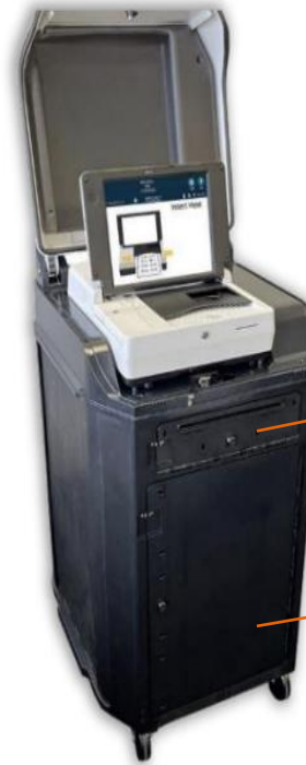
DS300 Ballot Scanner (formerly the DS200 scanner) –new updated machines

Emergency Compartment (formerly the Auxiliary Compartment)